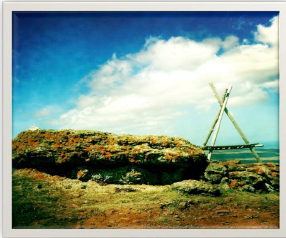
Huaka'i i Kanaloa-Kaho'olawe

**all information provided in this packet is subject to change**